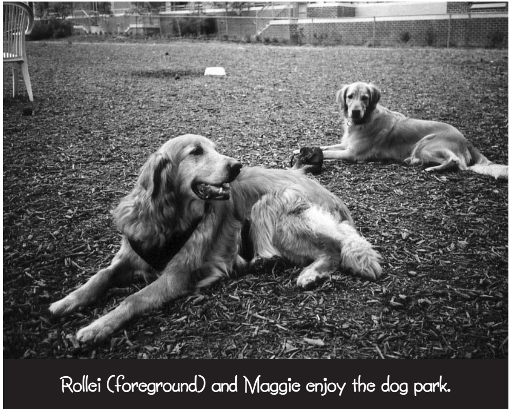
Rollei (foreground) and Maggie enjoy the dog park.

By late August, my husband gave up a long-planned vacation to a family wedding in Hawaii, but urged me to go while he nursed Rollei at home. By the time I returned, thanks to my husband’s care and a series of acupuncture treatments, Rollei had begun to take his first walks around the block – giant steps in his recovery. Meanwhile, we continued to educate ourselves about laryngeal paralysis and post-operative care. In retrospect, we now realize there were some warning signs of laryngeal paralysis, such as a raspier bark and increased panting in Rollei’s case. Each case of laryngeal paralysis must be evaluated and treated depending on the dog and circumstances, but in Rollei’s case, surgery literally breathed new life into an old dog itching to get a second chance.