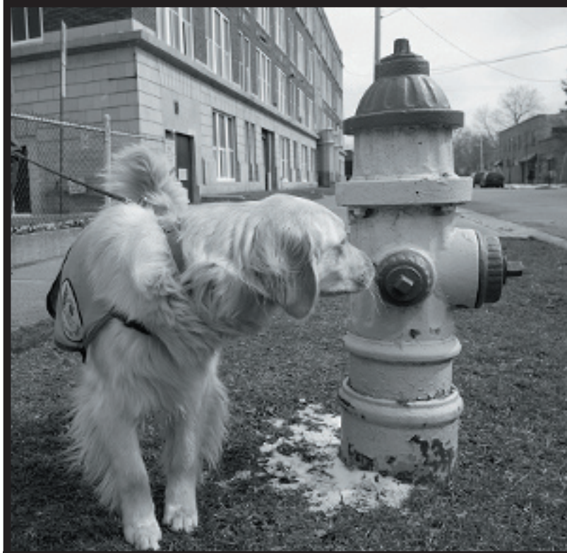
Come sniff out some great merchandise at the GRREAT Store!

Route 7 West towards Berryville. 8 miles after Round Hill, turn right onto Route 612/Shepherds Mill Road. Midas Touch Naturally Healthy Pets is 2.7 miles on the right.