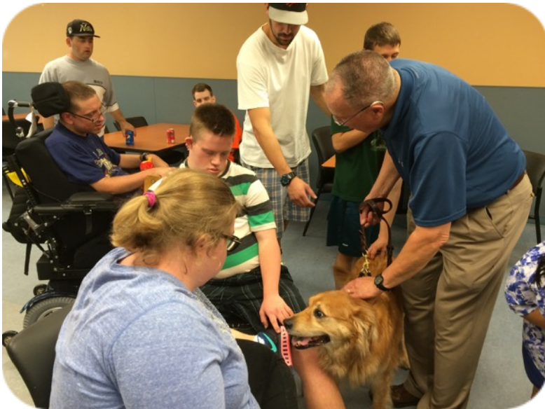
Carver at work with the ladies and gentlemen of Opportunity Builders Inc. in Millersville, MD (above)

The takeaway from this tale is pretty simple: senior dogs have so much to give and all they need is an opportunity. An opportunity to be a loving friend in a forever home; an opportunity to bond with a child, a senior citizen or other animal; an opportunity to be a therapy dog.