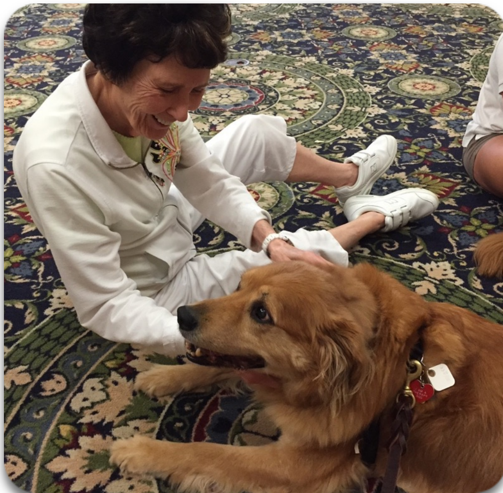
Carver with a resident of the Ginger Cove Retirement Community in Annapolis, MD

Several sessions with a professional trainer helped Carver to better respond to basic commands and adapt to