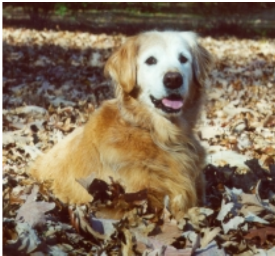
Casey Smith enjoying a bright fall day