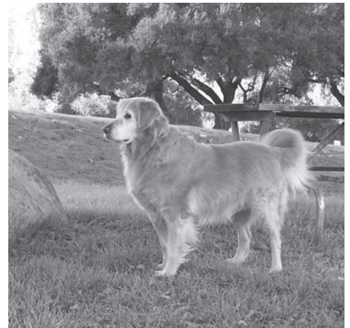
Sunshine (98-011) hit the road with her forever family in 2004.

There was always plenty to eat for the first few days, and then they took me to visit the vet. She's a very nice person and would get on the floor to talk to me. It was during this first visit with her that they decided I needed to lose about 30 pounds. I mean, after all just because my eyes were almost closed from the fat and I couldn't make it up the stairs!