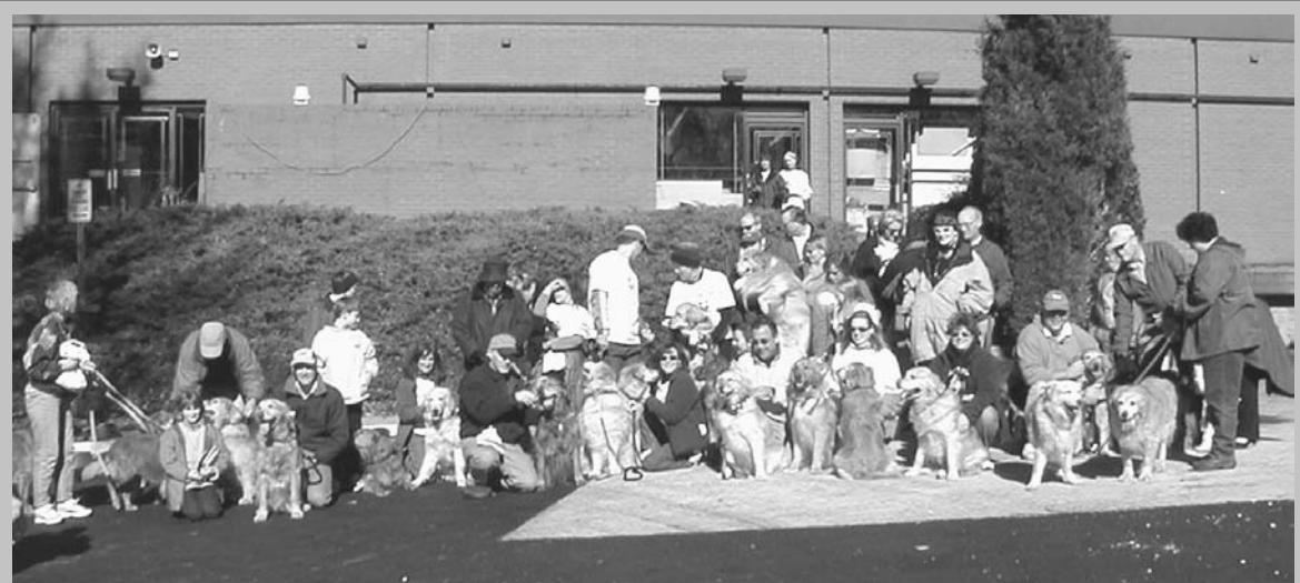
GRREAT members enjoy many events that are fun for people and for dogs. This gathering took place at last year's 3K fundraising walk.

We rely on membership dues, donations, and fundraising to carry out our missions. Your $30 membership dues keeps this newsletter coming to your mailbox every two months and will help us save more Golden Retrievers in 2006.