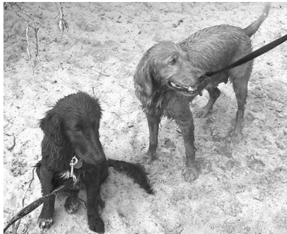
Allie and Chyann at Quiet Waters Doggie Beach

provided for owners to pick up after their dogs are provided.