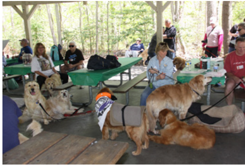
Dogs will be able to dine outdoors.