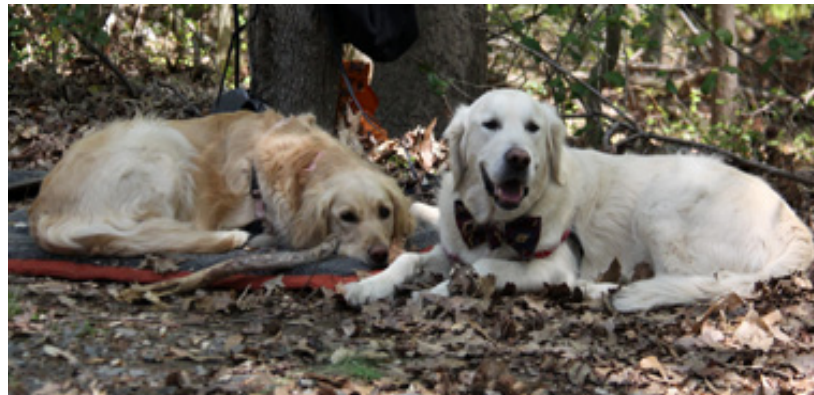
My Bow Tie is available at GRREAT Events!