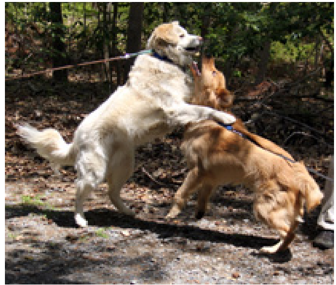
We know it's a Bark-B-Que but no one said we couldn't dance!