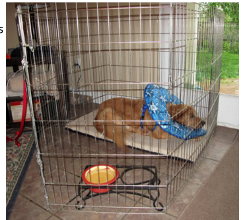
Sadie recovering in foster home

While Sadie's story appears headed for a happy ending, it has not come without significant cost. We anticipate that this initial stage of her treatment will easily exceed what we typically spend on four, if not five, dogs. This does not include the cost of the chapters yet to be written ... her recuperation and rehabilitation. Rescues like GRREAT are the only safety net for Golden Retrievers like Sadie - otherwise healthy, happy dogs whose owners cannot afford to pay for the treatment of a catastrophic injury. You can be part of Sadie's story. If you were touched by her plight, awed by her stoicism, or moved by her resilience, please consider making a generous contribution to GRREAT so that we can continue to reach out to dogs like Sadie at www.grreat.org/donate .