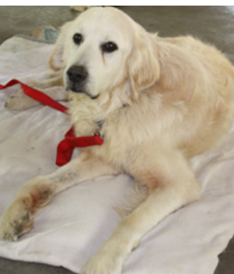
Hi! I'm Max too!