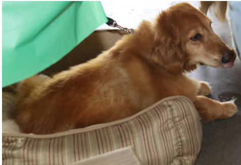
The face is familiar, but I don't remember your name...