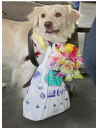
Look at all the stuff that I found playing the Scavenger Hunt!