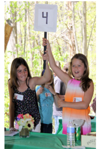
Tallying up the Scavenger Hunt.