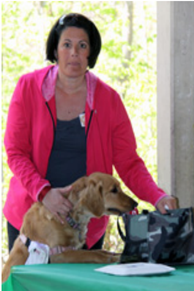
Got any treats in there, Mom?